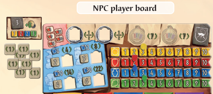
NPC player board

Note: During the game, the NPC will collect a lot of cards, so leave plenty of space below the player boards.