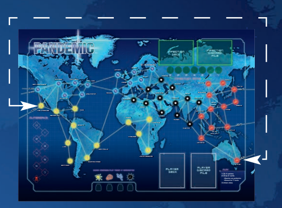
A white line that goes off the board "wraps around" to the other edge and connects to a city. Example: Sydney and Los Angeles are connected.

If no cubes of this color are on the board, this disease is now eradicated . Flip its cure marker from its "vial" side to its " \bigcirc " side.