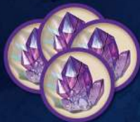
4 Purple tokens (Glassware)