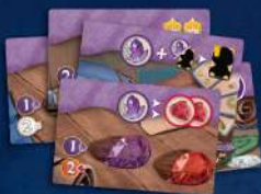
17 Counterfeiter cards