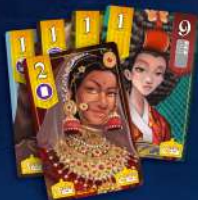
8 Royal cards