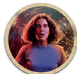
In Play side