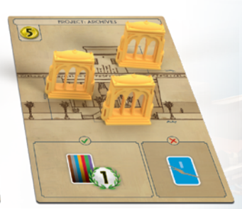
Setup example for a 5-player game