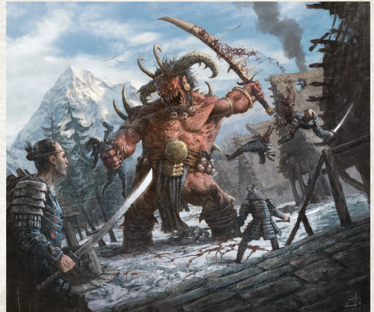
Above: Violence and Evil • Helge C Balzer Below: Way of the Shadowlands • Scott Wade