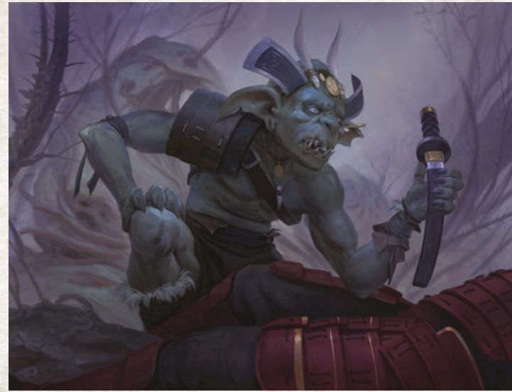
Above: Scavenging Goblin • Maurice Bota