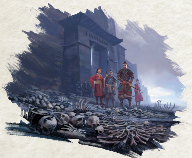
Below: Beyond the Wall • Axel Sauerwald