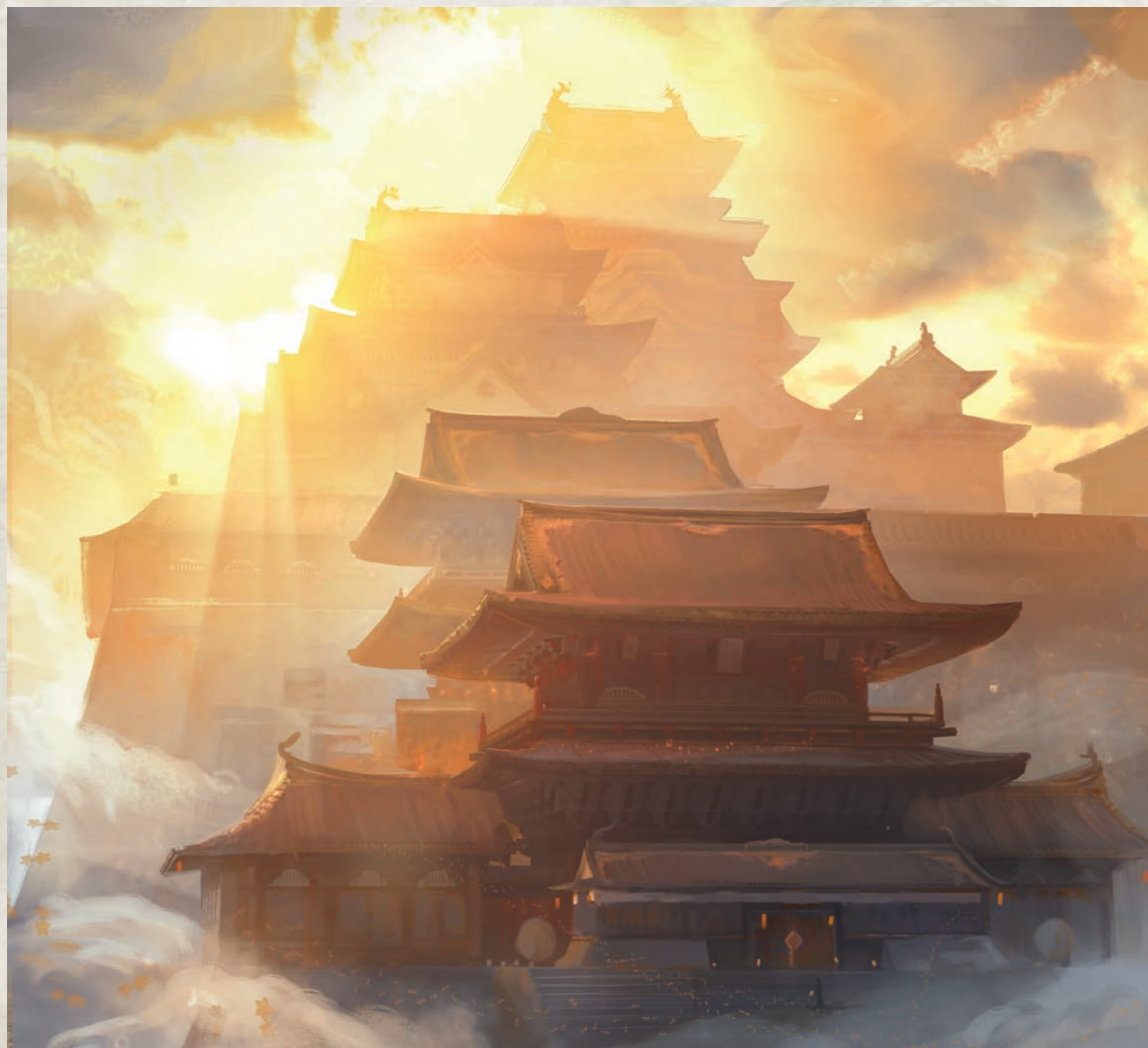
Above: The Imperial Palace

All of Rokugan belongs to, and is ruled by, the Emperor Hantei, but in practice the land is divided into a great many provinces, each under the stewardship of one of the Great Clans, or occasionally one of the minor clans, who lack divine ancestry. In return for the right to dwell in these lands, each clan serves the Emperor according to the needs of the Empire and their own traditions. Representatives of the Great Clans vie for political power in the Imperial Court at Otsan Uchi, and at the Winter Court, held each year at a site of the Emperor's choosing, in the lands of a particularly – if fleetingly – favored clan.