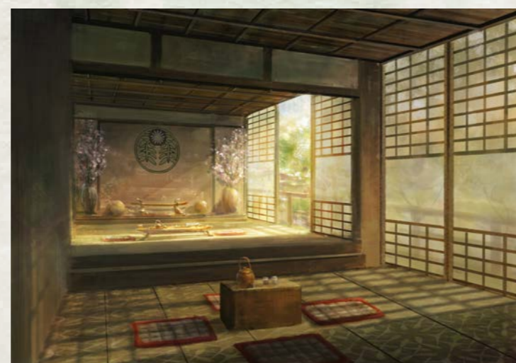
Above: Seppun Sensei's Court