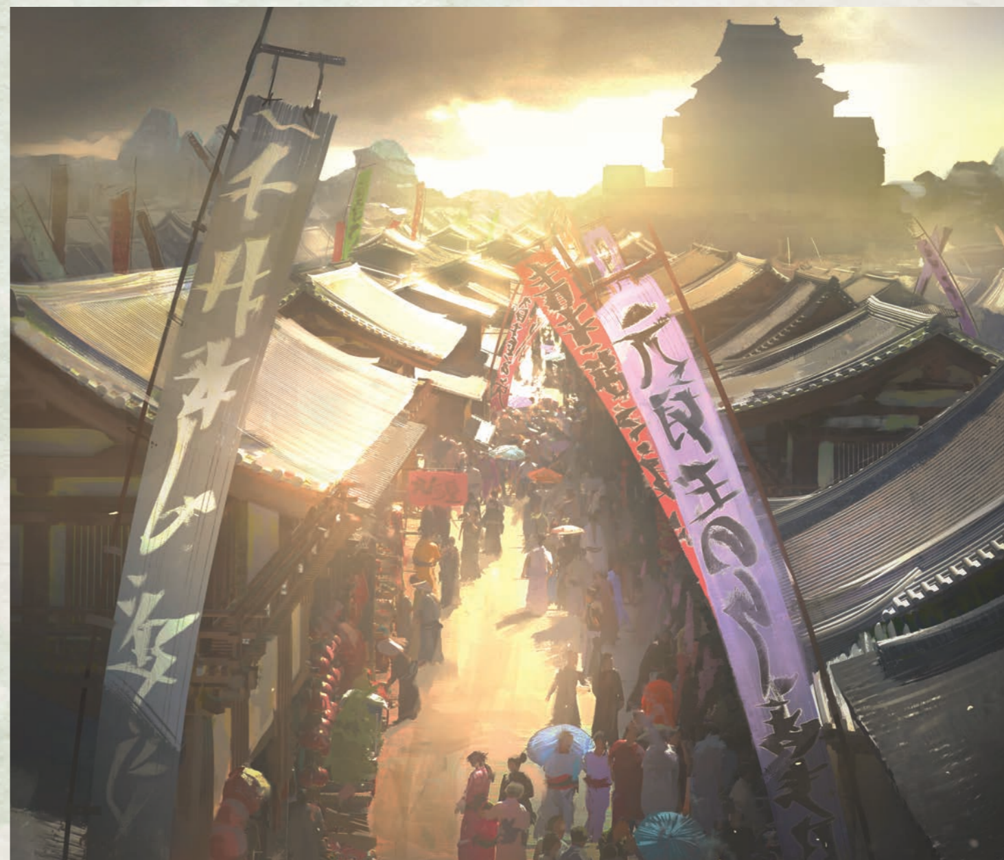
Above: Karada District, District of Fortitude