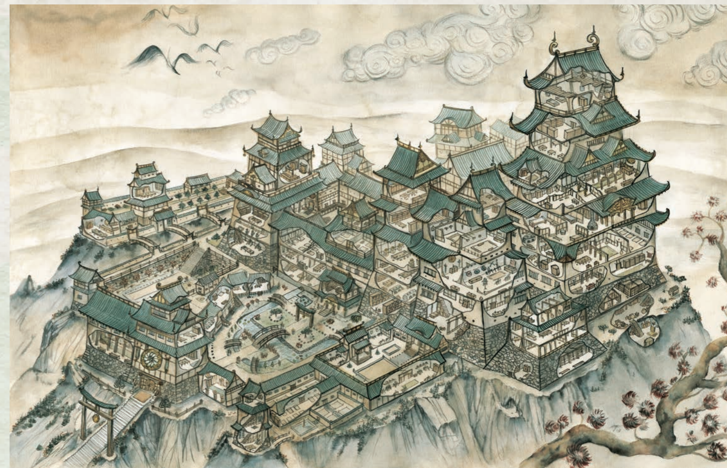
Below: Shiro Yogasha, Palace of the Emerald Champion • Francesca Baerald

"Our claim to these lands stretches back to the dawn of the Empire."