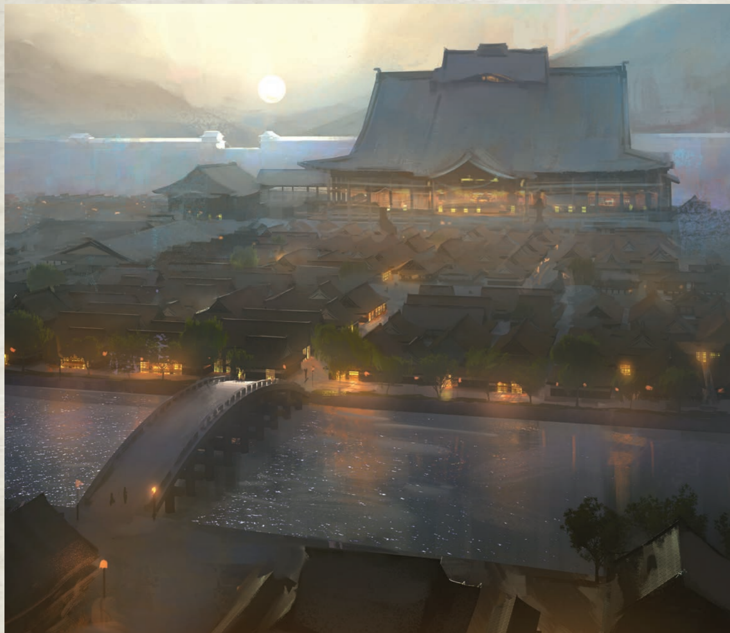
Above: Hito District, District of Rectitude