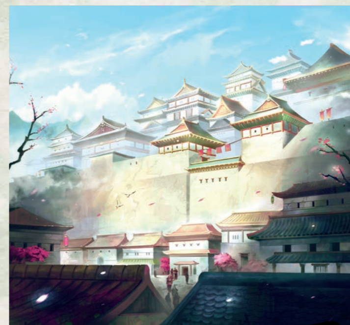
Above: Miwaku Kabe, the Enchanted Wall • Nele Diel

"Our claim to these lands stretches back to the dawn of the Empire."