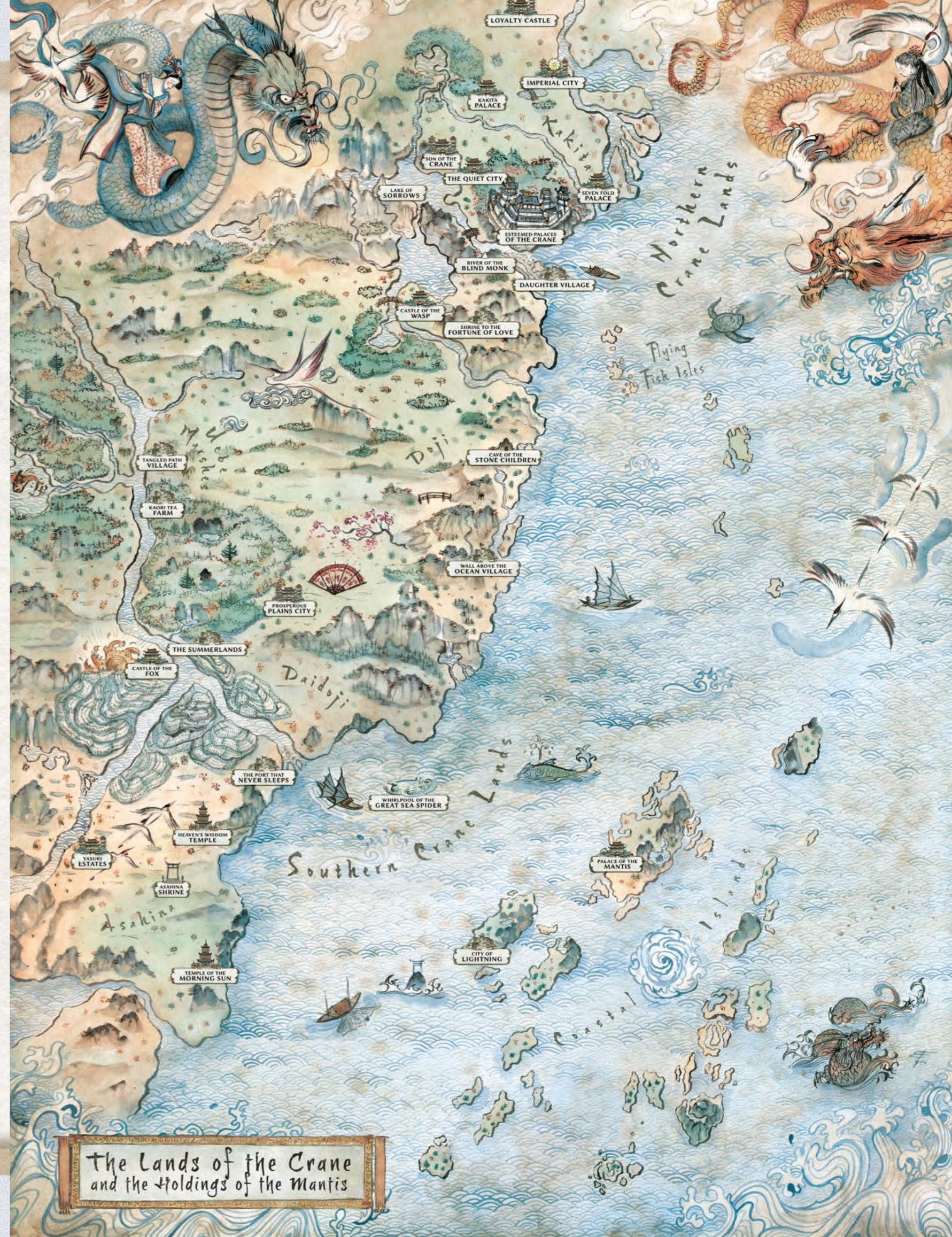
The Lands of the Crane and the Holdings of the Mantis