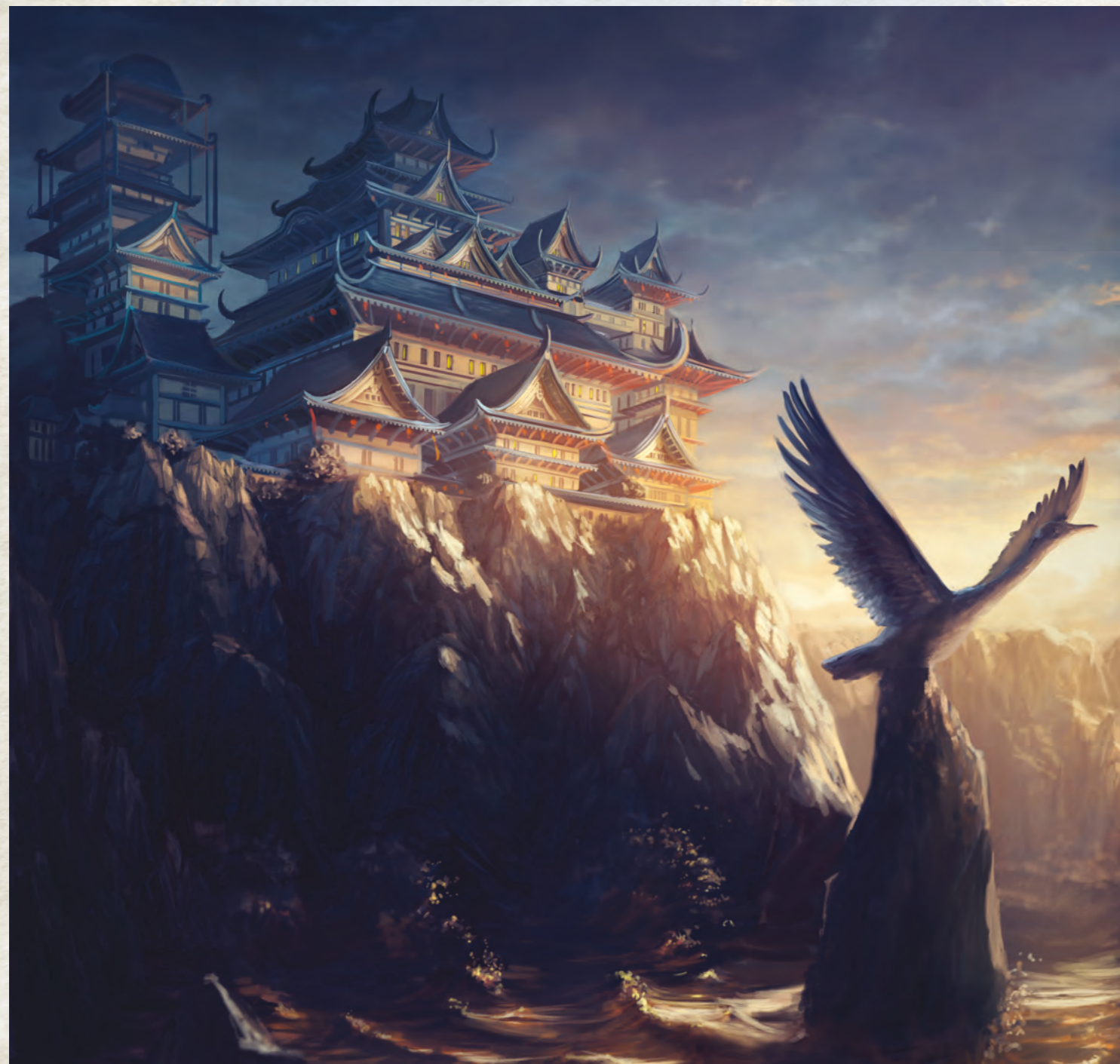
Above: The Esteemed Palaces of the Crane • Alayna Lemmer Opposite: The Lands of the Crane and the Holdings of the Mantis • Francesca Baerald

Crane lands are as fertile and verdant as the fisheries beyond their shores are bountiful. These hinterlands provide the Crane with much of their wealth, but their power derives from their literal and metaphorical closeness to the Imperial Court, with the seats of the Doji, Daidoji, and Kakita all nearby. But the Crane lands are bordered by rivals, too – the fierce Lion in the north and the minor Mantis Clan in the islands to the Crane's east, sea raiders known to prey upon the Crane's coastal domains.