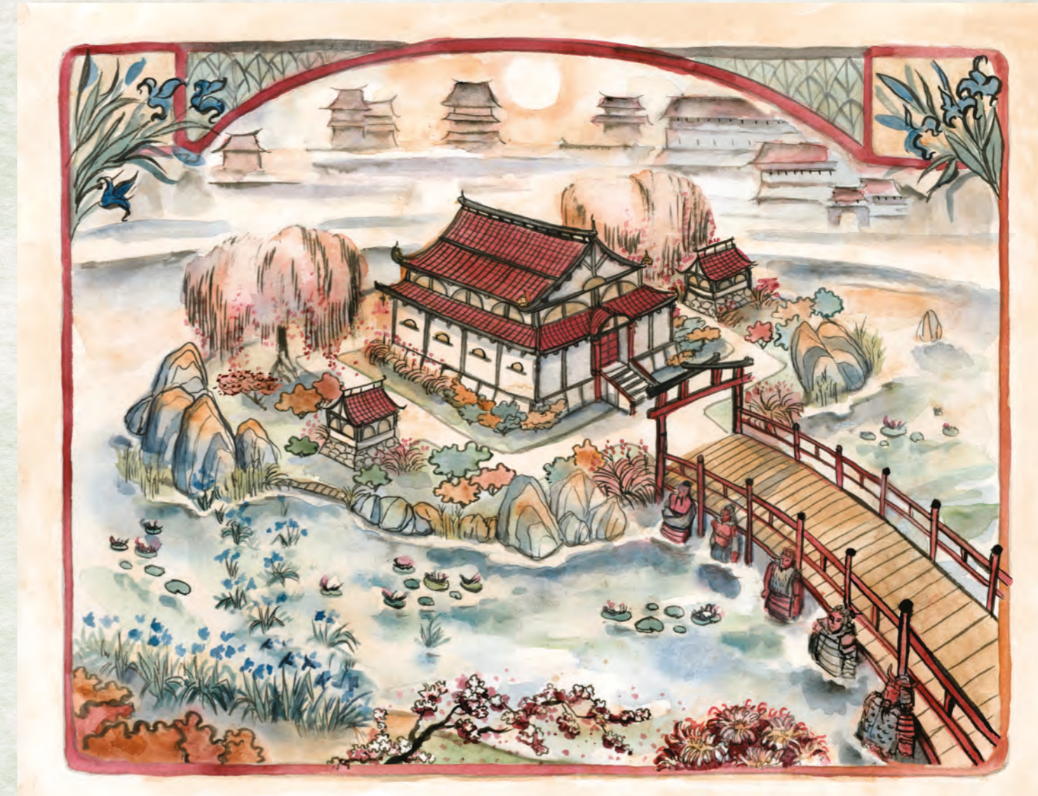
Above: Shrine to Hantei Right: Way of the Chrysanthemum