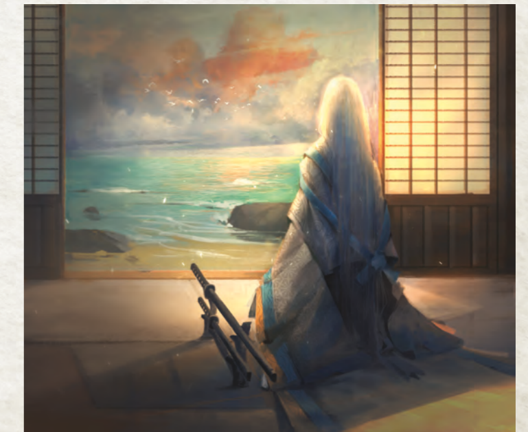
Below: Soul Beyond Reproach • Le Vuong