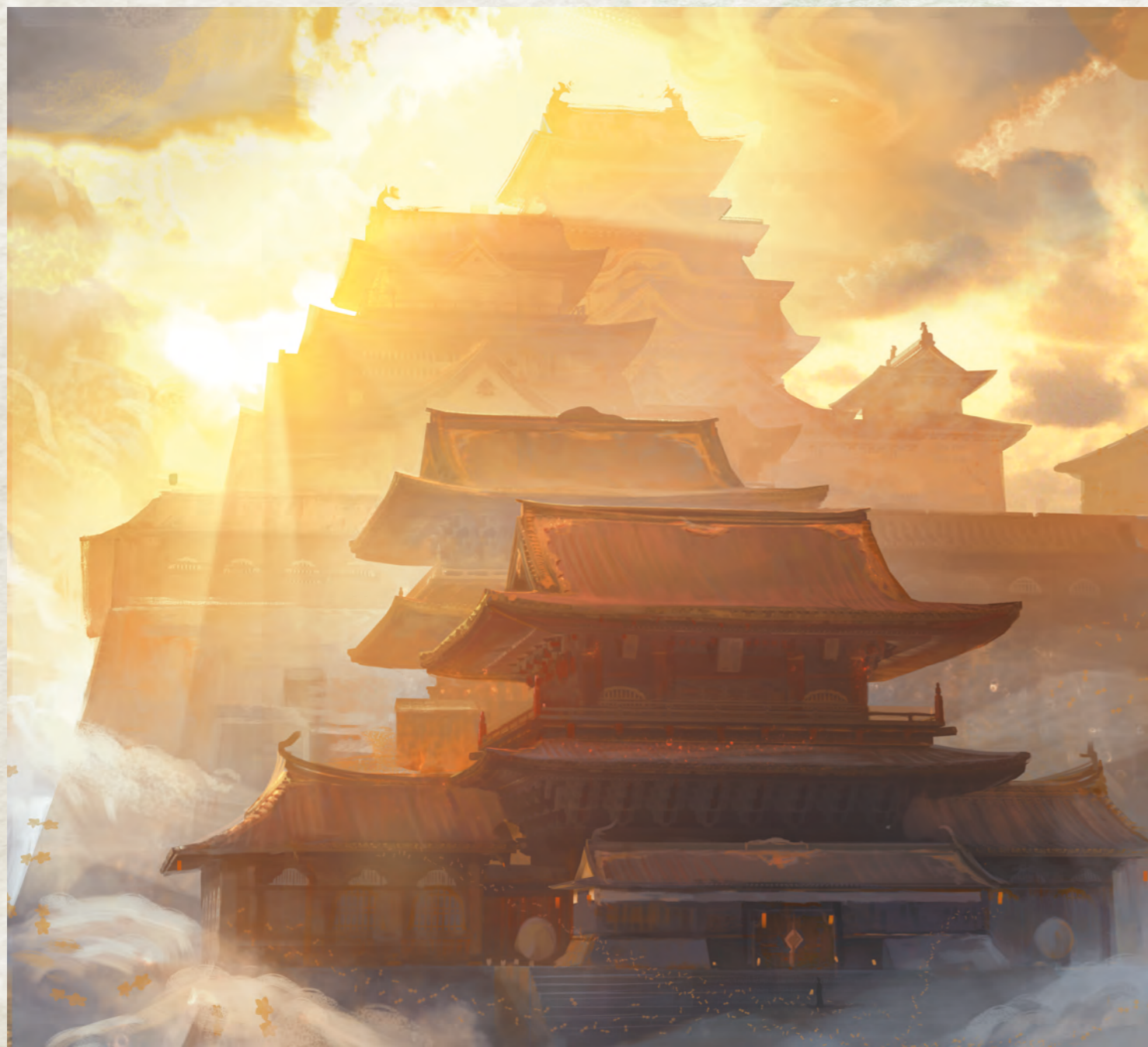
Above: The Imperial Palace

All of Rokugan belongs to, and is ruled by, the Emperor Hantei, but in practice the land is divided into a great many provinces, each under the stewardship of one of the Great Clans, or occasionally one of the minor clans, who lack divine ancestry. In return for the right to dwell in these lands, each clan serves the Emperor according to the needs of the Empire and their own traditions. Representatives of the Great Clans vie for political power in the Imperial Court at Otsan Uchi, and at the Winter Court, held each year at a site of the Emperor's choosing, in the lands of a particularly – if fleetingly – favored clan.