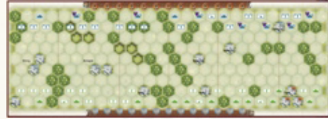
WBC 2005 - Online Release