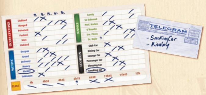
The Mystery Express is about to leave Budapest... some players have already wired in their first suspicions.

Should several players be tied for the highest number of Crime elements correctly identified, the telegrams each player sent from Budapest will be used to break the tie (see An Important Telegram and End Game on p. 5).