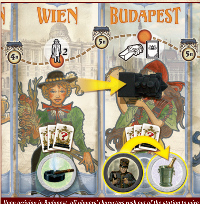
Upon arriving in Budapest, all players' characters rush out of the station to wire a telegram before sharing some of their knowledge with their fellow passengers... The Conductor moves to the Lounge car for a well-deserved drink.

Conductor accordingly to the new Car indicated on its token, in preparation for the next leg of the trip.