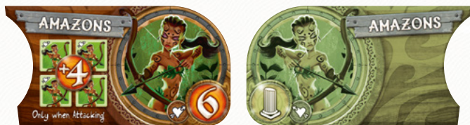
Amazons, Active and In Decline