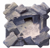
10 Troll Lairs