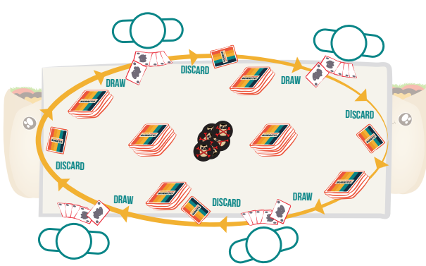
The cards will move from player to player around the table.

Draw cards from your Personal Draw Pile on your right and discard cards face down onto the Personal Draw Pile of the player to your left.