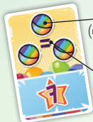
Card with no Ticket half

Wild Gasha (can be treated as any Gasha)