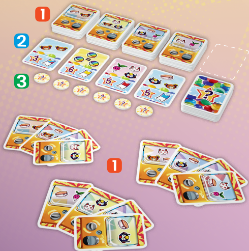
Setup example for 3 players

At the end of the game, the player with the most beautiful collection is the winner.