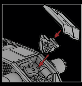
FLAPS CAN BE ASSEMBLED EITHER OPEN OR CLOSED